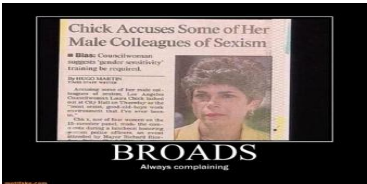
Picture 1 (Taken from: http://articles.latimes.com/1995-06-24/news/mn-23690_1_gender-sensitivity ; the article published by The L.A. Times on June 24, 1995 )