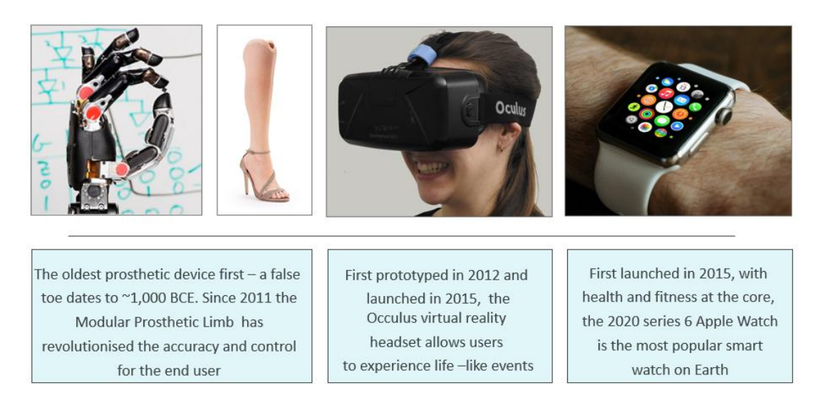
Figure 2. Selected advances in human enhancements between 2011 and 2015.

in space where a synthesis of thoughts from multiple participants may be required to rapidly assess a situation and instigate an action.