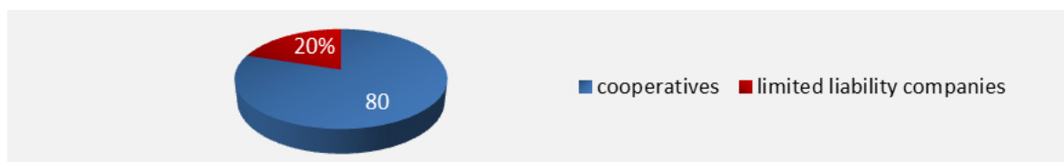
Figure 1: Dairy industry companies in the Podlaskie province by legal form in 2010-2012

Source: Own study based on the conducted research