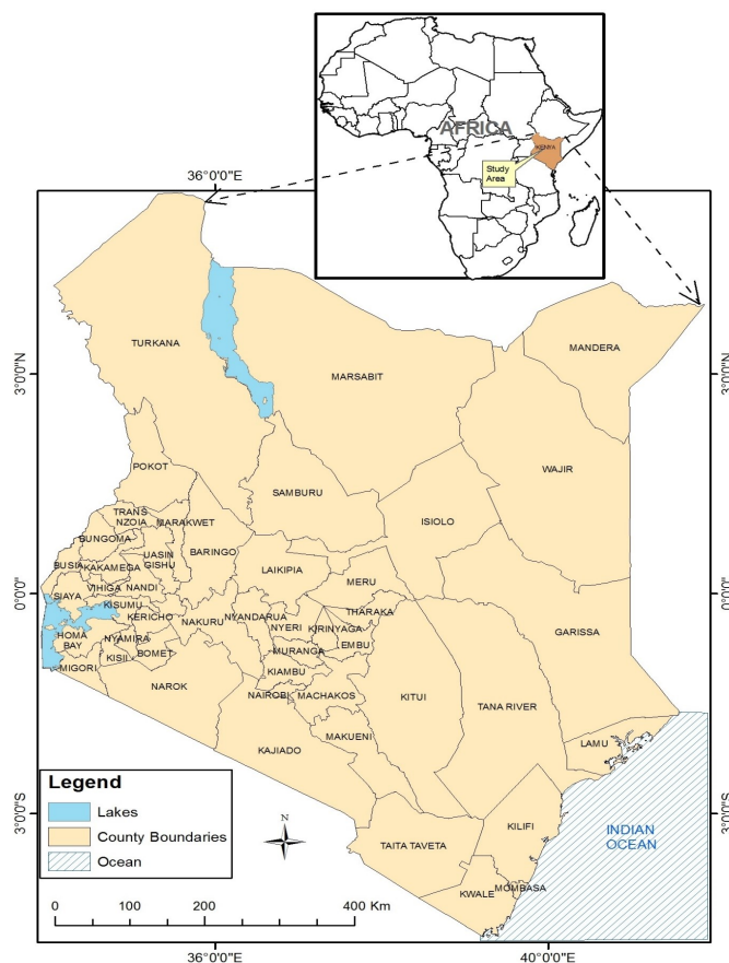
Figure 2: Geographical Map of Kenya showing the Study Area

This study was carried in Kenya. Kenya is located in the continent of Africa. Kenya lies across the equator and is found in the eastern coast part of Africa. Maps of World indicate that Kenya’s latitude and longitude lie between 0.0236° S and 37.9062° E (KNBS, 2010; Gisore, 2021). The map in Figure 2 below shows the geographical area covered by the study.