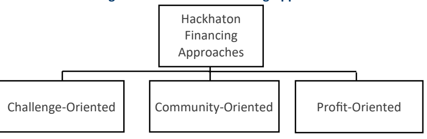
Figure 1: Hackathon Financing Approaches